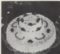
10th Anniversary Cake