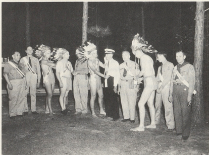
Original Ordeal at Darden by Octoraro Team