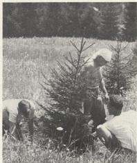
Commissioners on Ordeal with Octoraro at Camp Horseshoe