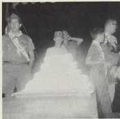
15th Anniversary Cake

Our patches are a symbol of Blue Heron's quality and a token of one of the outstanding lodges in the nation. In accordance with the Blue Heron tradition another patch was developed. The Jacket patch was conceived to furnish a supplement to a member's accessories and to recognize another point in Blue Heron History.