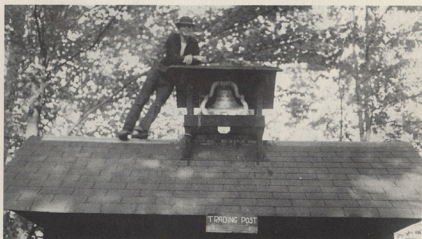
1953 Area III-C Bell