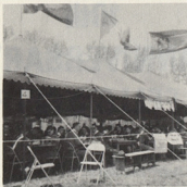
15th Anniversary Fellowship