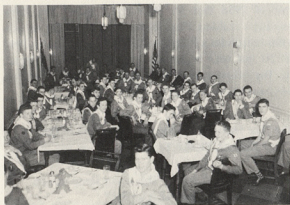
Annual Lodge Winter Banquet