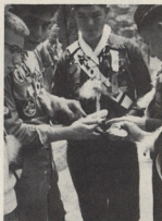
Swapping at the first 3-C Pow Wow