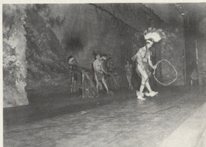
Blue Heron Indian Pageant at Granby High, 1950